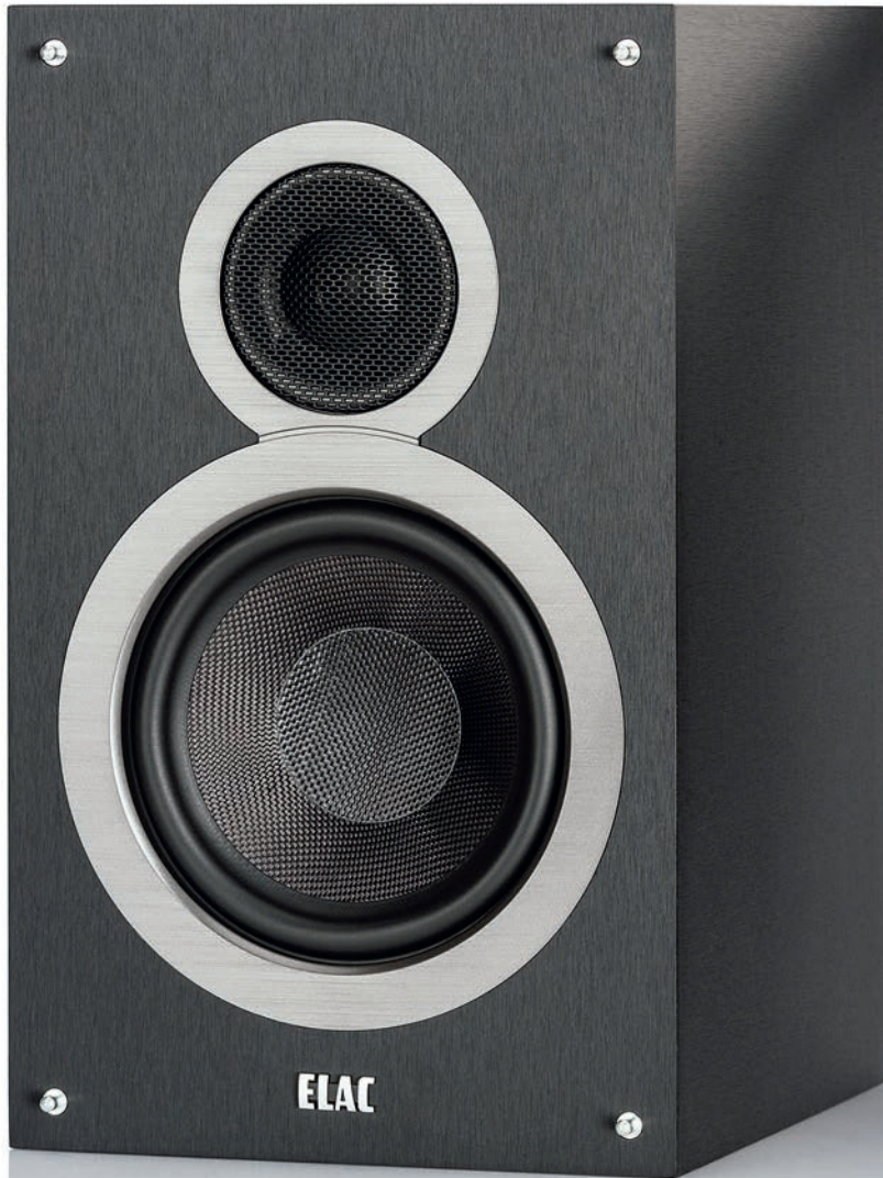
LEFT: Elac's largest standmount Debut speaker employs a 6.5in aramid-fibre bass/mid cone that crosses over to a 1in silk dome tweeter at 3kHz. The MDF cabinet has a black, brushed vinyl wrap

B6 is more like an Anglo-American teenage boy out on the tiles with a bottle of Tequila. Now, although that's very different from what's come before, it's not necessarily a bad thing. Indeed, at this price point the only thing a good speaker can be is fun – we'll leave considerations of transparency, lack of coloration, wide bandwidth, dynamic handling and the like to the big boys at ten times the price.